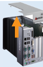
2. Withdraw the thumbscrew and remove the top cover