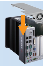
3. Replace it by plugging the hot-pluggable fan module cover into the fan connector on CPU board