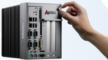
1. Undo the thumbscrew by hand