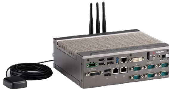
MXE-1400 with Antenna