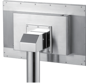
Stainless steel housing for full IP65/IP69K