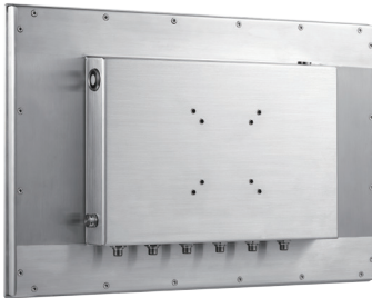
Titan-AL with M12 connectors