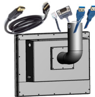
Water and dust proof is easy and reliable with standard cable connectors. No extra cost needed.