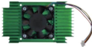
Active Heat Sink