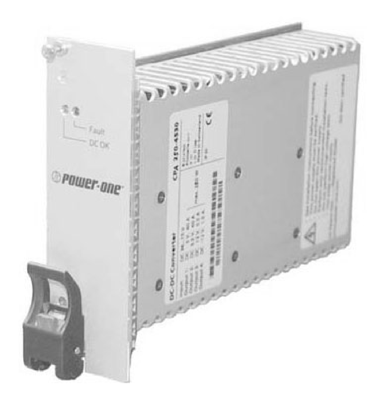
Figure 1: View of Power Supply Unit CP3-SVE-P200DC