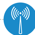
Wireless Service Provider