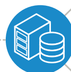
Asset Management Platform