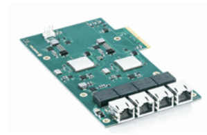
// ADA-COMe-T7-G2 4x 10G RJ45