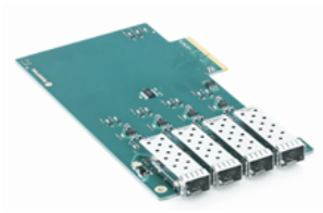
// ADA-COMe-T7-G2 4X 10G DAC