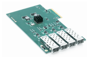
// ADA-COMe-T7-G2 4x 10G SFP+