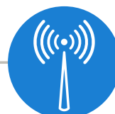
Wireless Service Provider