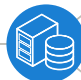
Asset Management Platform