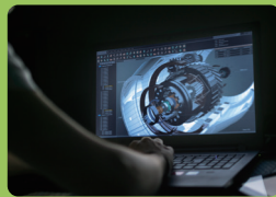
Professional graphics users