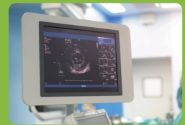
Embedded industrial applications